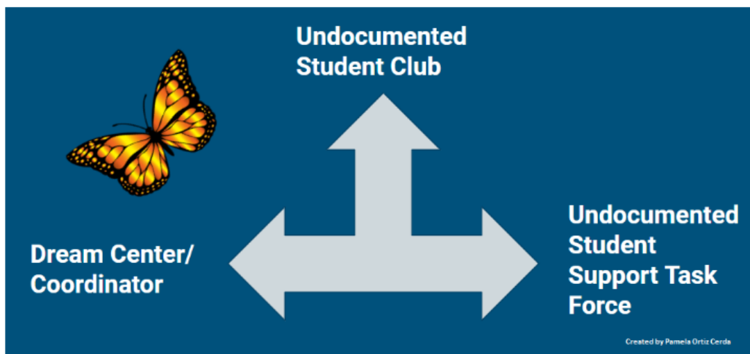
The Three Pillars of a Strong Undocumented Student Support Program

The Undocumented Student Club gives the students a voice and provides guidance to address their needs; the Undocumented Student Support Task Force supports with institutional barriers and programming; and the Dream Center Coordinator takes care of day-to-day support and case management. The formation and collaboration between all three pillars is key to building strong programming, securing institutional support, and creating a solid foundation to support students holistically with student voice at the forefront.