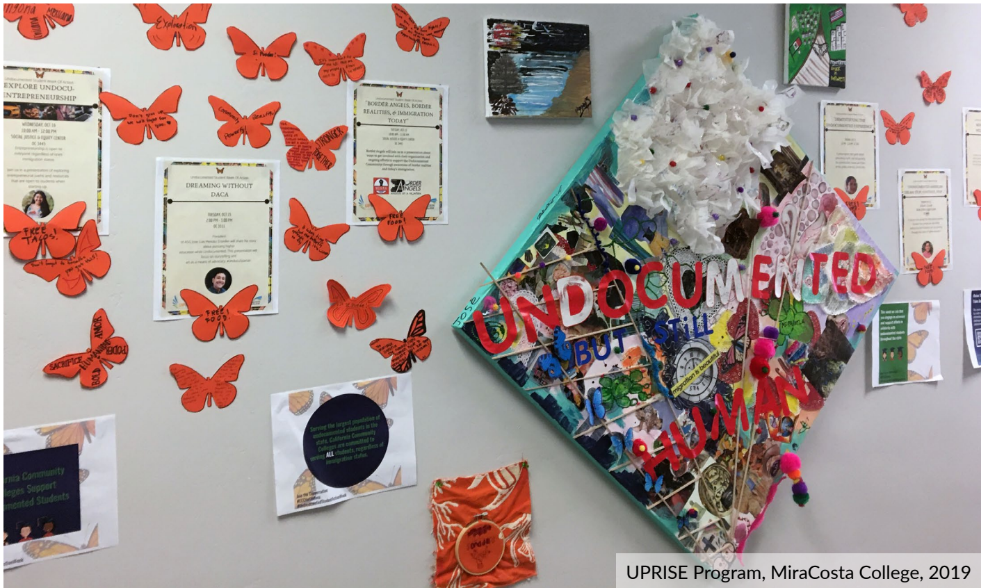
UPRISE Program, MiraCosta College, 2019